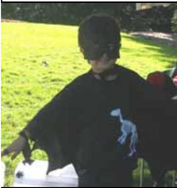
Gilbert's friend 'Batman Jnr' paid us a visit and gave us a glimpse of his impressive wings

What a funtastic day! The 'Kids Day Out' at Mt Coot-tha Botanic Gardens is an event Bat Care Brisbane looks forward to every year. Our stall is always a huge success and this year was no exception. Thousands of kids and their parents turned up to make crafts, paint, play, learn, sing and dance to the music. Naturally Gilbert was a star attraction and we were swamped with people all day with questions, stories and interest in our merchandise.