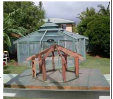
'Belfry Manor' and the original model in the foreground

Halfway through building, the name 'Belfry Manor' somehow crystallised. We didn't have a Belfry so he built one. I don't suppose many people can actually lay claim to having bats in their Belfry.